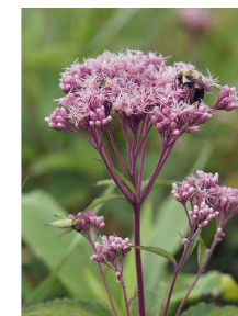
Joe Pye weed ( Eutrochium purpureum ) a wetland plant, from the Winnebago Lakes Council photography conservation education project: http://winnebago photography.blogspot.com/